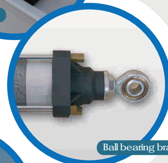
Ball bearing bracket